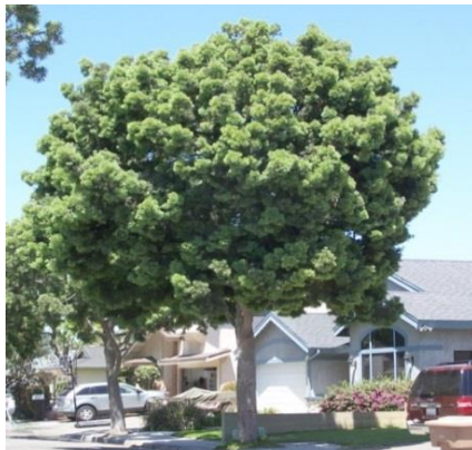
#23 Fern Pine – Evergreen 8 Foot or More Parkway