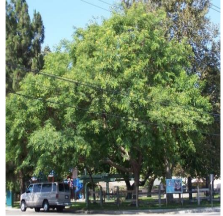
#21 Tipu – Deciduous 8 Foot or More Parkway