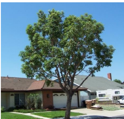
#17 Brisbane Box – Evergreen 6 Foot or More Parkway