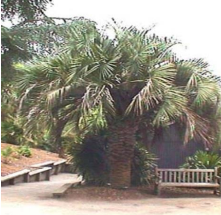
#19 Pindo Palm 6 Foot or More Parkway