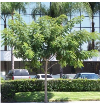
#16 Silk Tree (Mimosa) – Deciduous 6 Foot or More Parkway