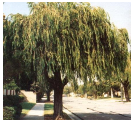
#18 Peppermint – Evergreen 6 Foot or More Parkway