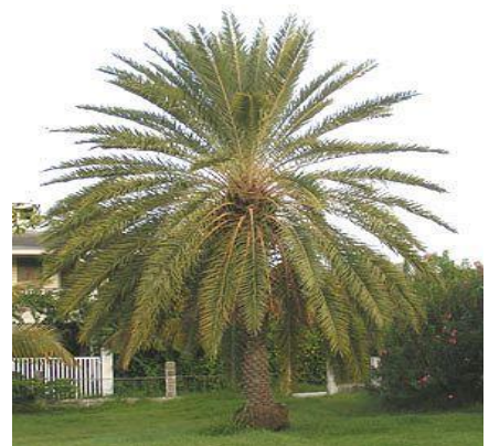
#24 Date Palm 8 Foot or More Parkway