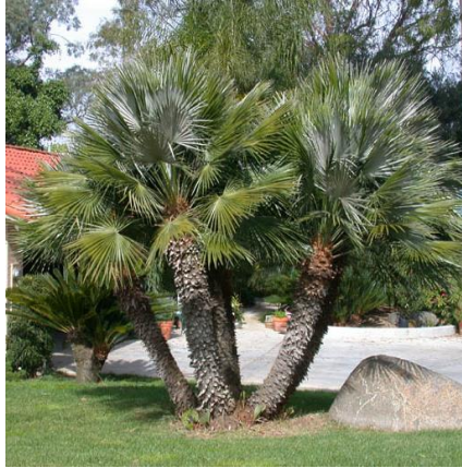
#20 Mediterranean Fan Palm 7 Foot or More Parkway