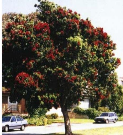
#11 New Zealand Christmas Tree – Evergreen 5 Foot or More Parkway