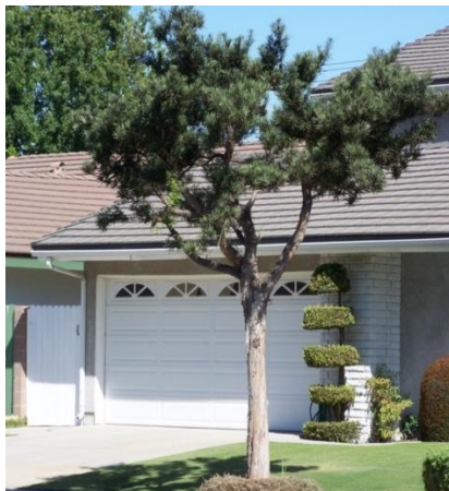
#5 Yew Pine – Evergreen 3 Foot or More Parkway