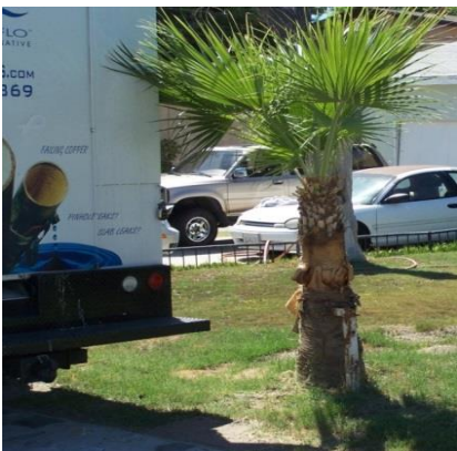
#7 Guadalupe Palm 4 Foot or More Parkway