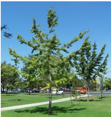
#14 Maidenhair – Deciduous 6 Foot or More Parkway