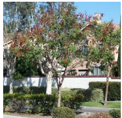
#9 Goldenrain – Deciduous 5 Foot or More Parkway