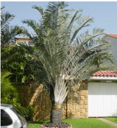
#4 Triangle Palm 3 Foot or More Parkway