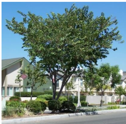
#8 Purple Orchid – Deciduous 5 Foot or More Parkway