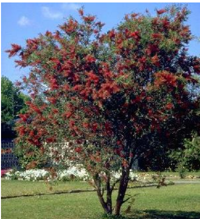
#13 Weeping Bottlebrush – Evergreen 5 Foot or More Parkway