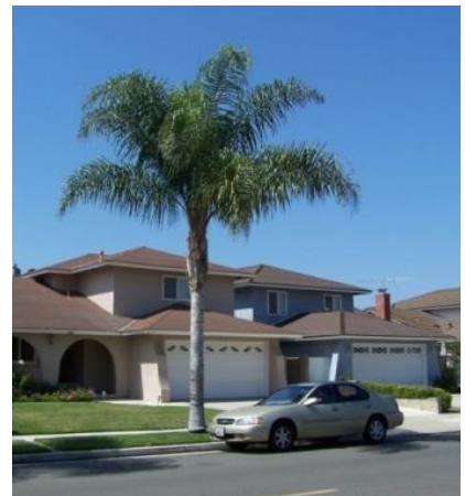
#6 Queen Palm 3 Foot or More Parkway