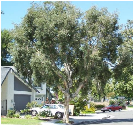
#22 Cajeput – Deciduous 8 Foot or More Parkway