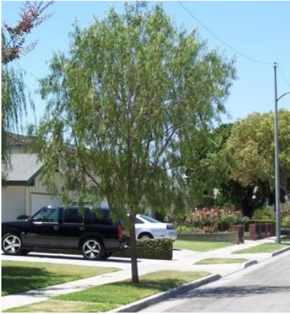
#10 Australian Willow – Evergreen 5 Foot or More Parkway