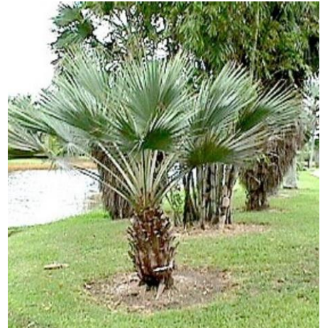
#12 Mexican Hesper Palm 5 Foot or More Parkway