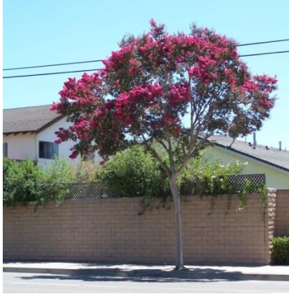
#1 Crape Myrtle - Deciduous 2 Foot or More Parkway