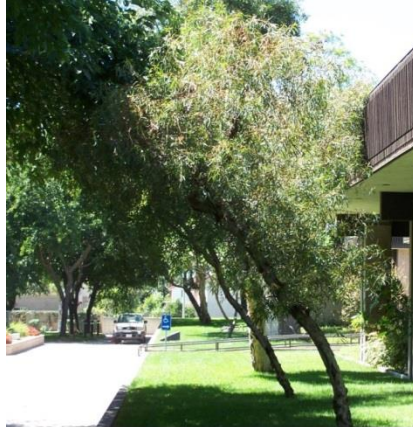
#2 Coral Gum - Evergreen 2 Foot or More Parkway